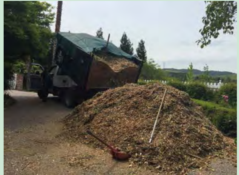
Wood chips make great mulch and tree companies offer wood chips for free when you take a truck load!

SHOWCASE your horticultural talents by mixing textures, colors, and sizes in your garden, always being aware of water, sunlight and soil Ph. needs. A lemon-lime nandina paired with a black adder phormium and a purple salvia are spectacular bedmates.